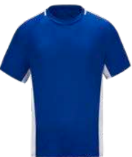
RM06-07 Royal Blue/White