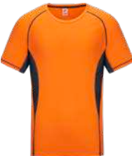
RM05-06 Orange/Dark Grey