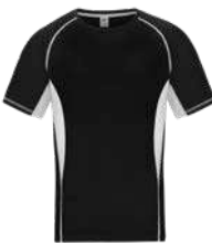
RM05-01 Black/Light Grey