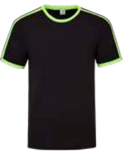
RM08-01 Black/Neon Green