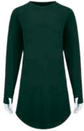
MM01-05 Dark Green