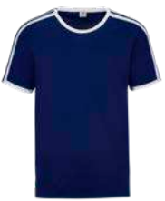
RM08-07 Royal Blue/White