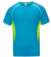
RM05-17 Sea Blue/Neon Yellow