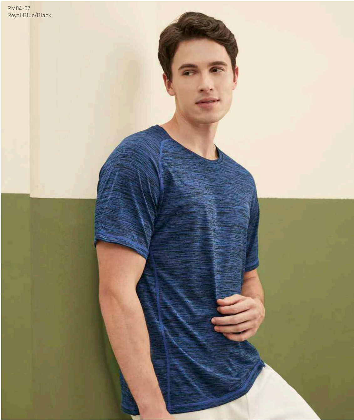
RM04-07 Royal Blue/Black

product features Unisex | 100% PrimeTech™ Microfiber Fabric Construction: Triblend Lycra Interlock Quick drying | Antibacterial Antimicrobial | Anti-odour Breathable | Anti UV