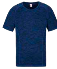
RM04-07 Royal Blue/Black