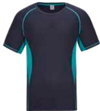
RM05-25 Dark Grey/Teal Green