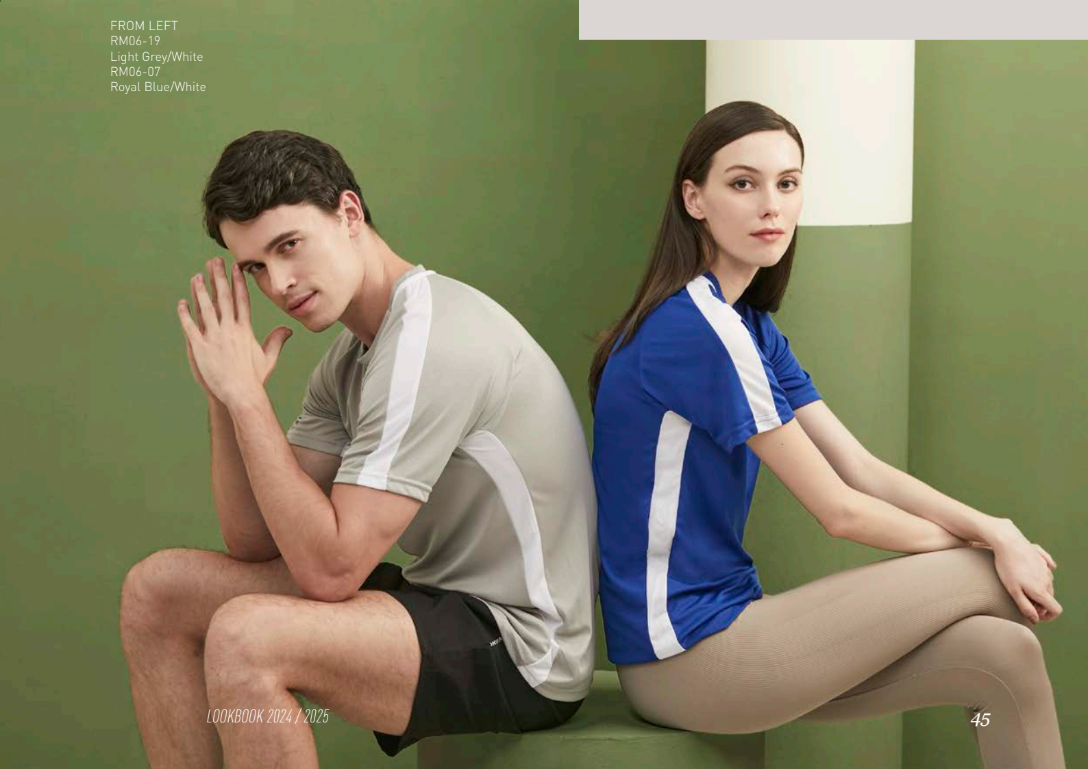
FROM LEFT RM06-19 Light Grey/White RM06-07 Royal Blue/White

product features Unisex | 100% PrimeTech™ Microfiber Fabric Construction: Waffle Quick drying | Antibacterial Antimicrobial | Anti-odour Breathable | Anti UV