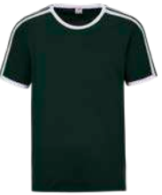
RM08-05 Dark Green/White