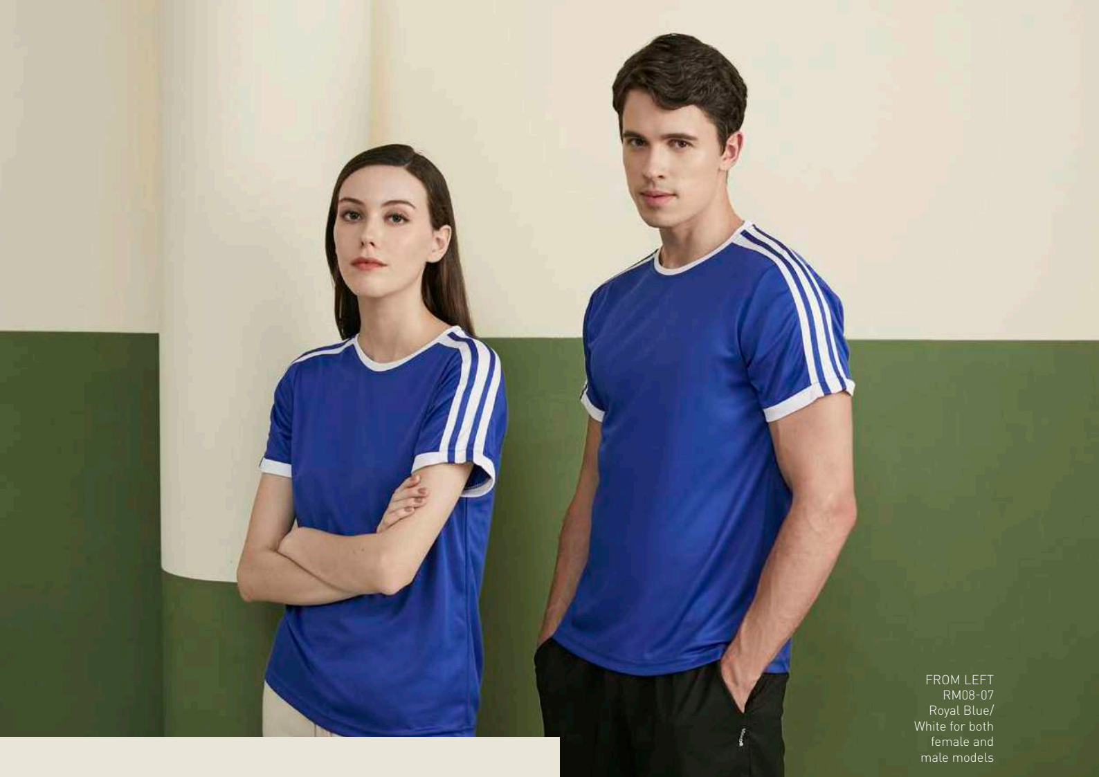
FROM LEFT RM08-07 Royal Blue/ White for both female and male models