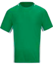
RM06-20 Milo Green/White