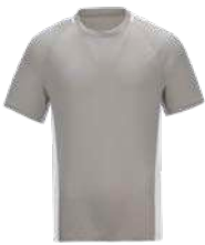
RM06-19 Light Grey/White