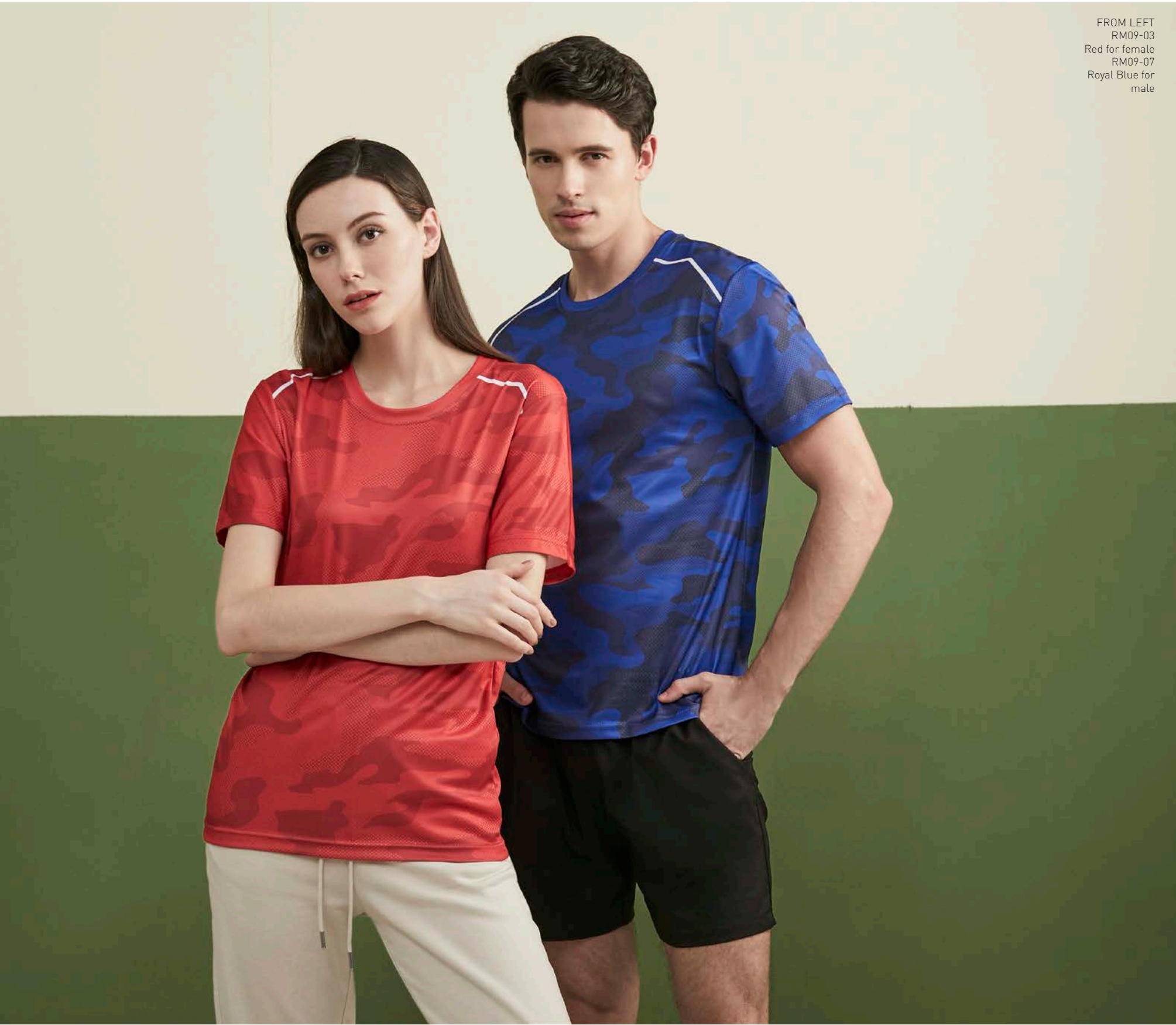
FROM LEFT RM09-03 Red for female RM09-07 Royal Blue for male