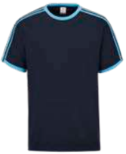
RM08-02 Navy/Sea Blue